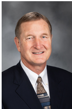
Senator Jeff Holy