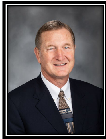
Senator Jeff Holy 6 th District