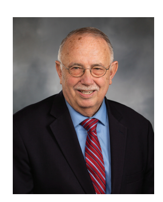
Senator Steve Conway