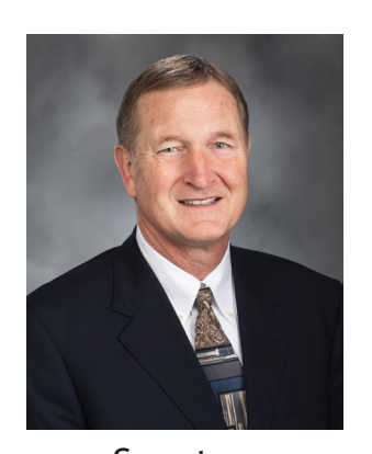
Senator Jeff Holy