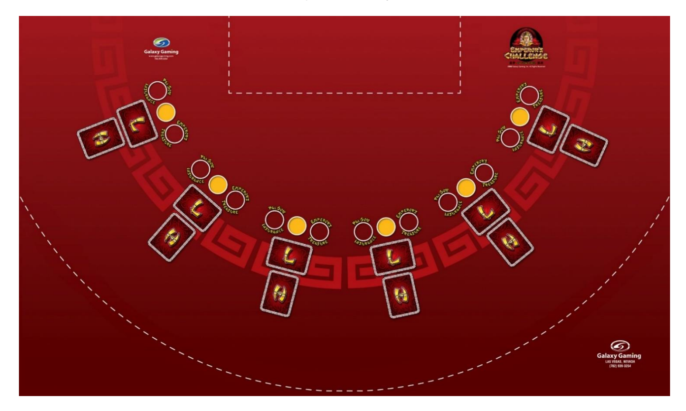
Example Table Layouts