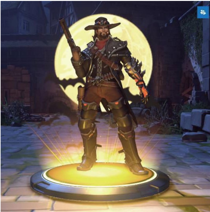
In Overwatch, cosmetic loot boxes contain “skins,” which change a character’s appearance, but do not help players progress in the game.

Game developers artificially restrict gameplay in order to get players to invest in microtransactions (loot boxes) that make the game more fun and allow the player to progress in the game much faster.